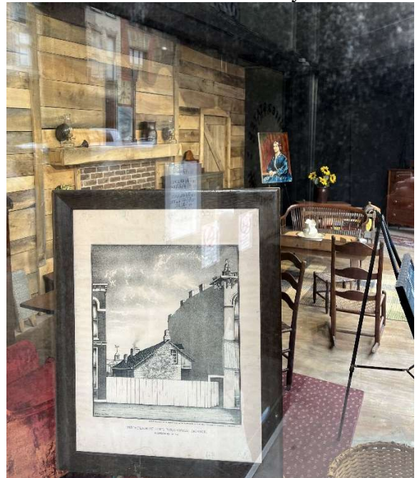
The Stonewall Jackson home display in Clarksburg. Please excuse the window glare that distorts the picture just a bit.

now located on the site of the Jackson home, across the street from the Harrison County Court House.